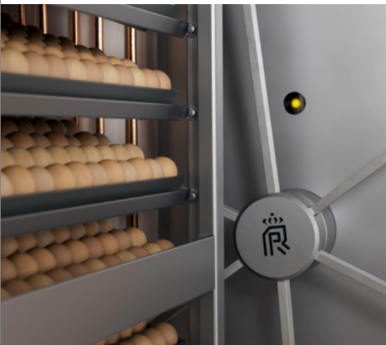
Bi-directional airflow for truly homogeneous temperature distribution