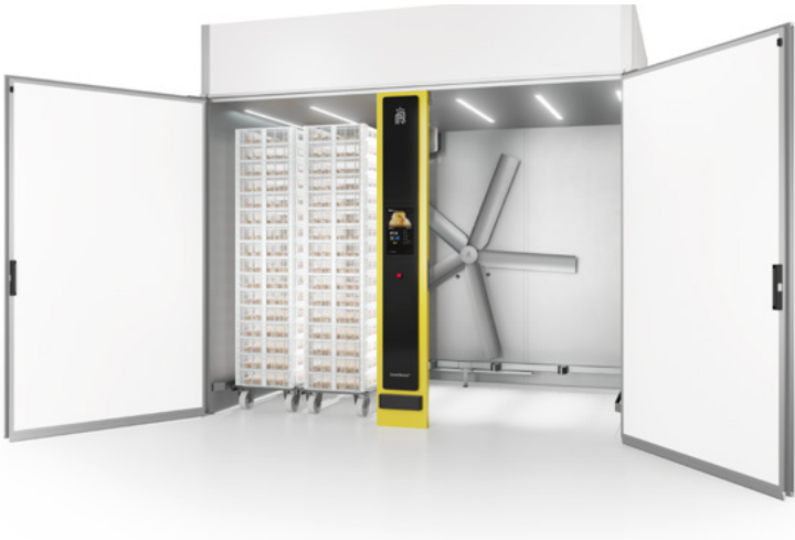
Flexible post-hatch feeding