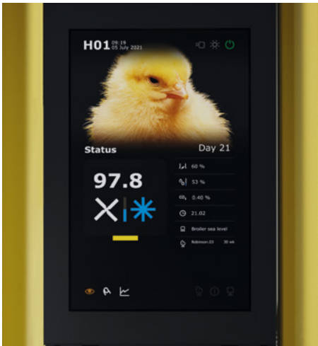
Highly intuitive user interface