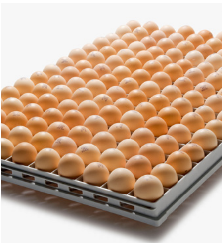
SmartSense™ accommodates a wide variety of tray types