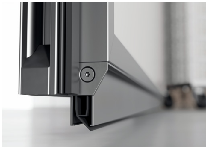
Automatic drop-down seals guarantee an airtight seal