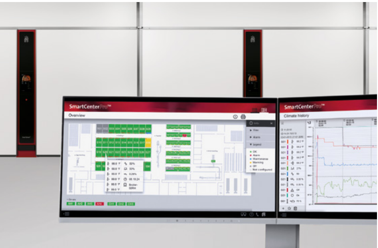
Total hatchery control via SmartCenterPro™