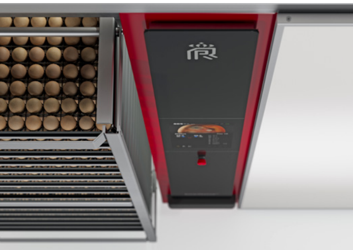
Robust, ergonomic design